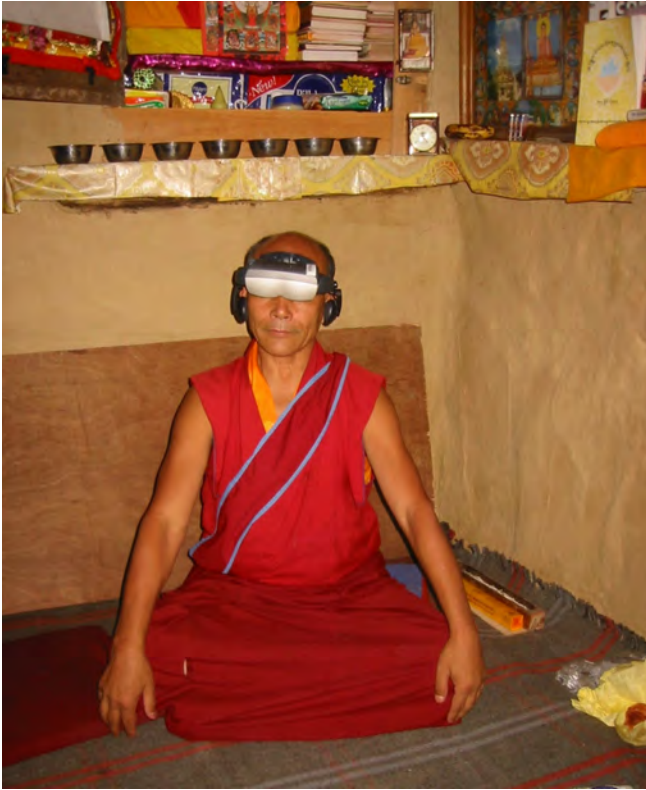
FIGURE 4 Tibetan Buddhist monk in a retreat hut in the hills above Dharamsala, wearing goggles used to display images for the measurement of binocular rivalry [Color figure can be viewed at wileyonlinelibrary.com ]

drivers were arguing with one another and suggested this really had to be solved, that no one was in the wrong or right, and that a fair way to resolve the impasse was with a coin toss. Through our translator, Jack obtained the agreement of both drivers, tossed the coin, and the road was soon open (Figure 5a,b).